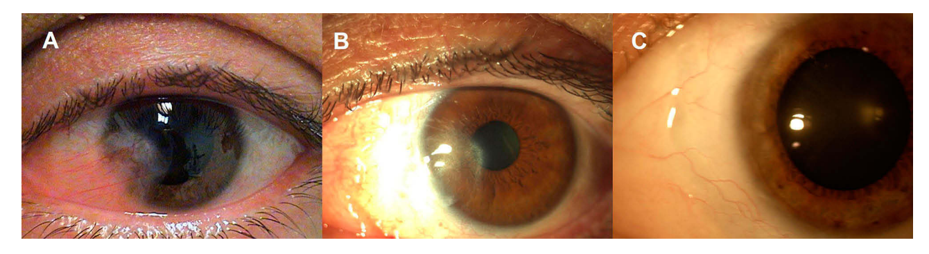
Figure 3 Residual corneal scar. (A) Recurrent pterggium preoperative; (B) residual corneal scar I week postoperative; (C) 12 years post laser laser corneoplastique.

To date, there is still a debate on the optimal extent of surgical excision necessary to prevent pterygium recurrence with many authors arguing the requirement of simple removal of the pterygium head while others argue extensive dissection and excision of the entire ptervgium. 17,18 A main concern with limited excision is the possibility of residual pterygium (especially for aggressive pterygia) that can lead to recurrence. Supporting this notion, Bai et al<sup>19</sup> reported spatial differences in different parts of pterygium tissue wherein cells from the pterygia head and body showed higher colony forming units and was correlated to cell expression of p63α, a molecule involved in the regulation of epithelial maturation. Hence, the surgical procedure described in our study aims to remove the entire growth by using a lamellar corneal approach along with atraumatic yet complete pterygium removal. We also performed minimal dissection of the scar tissue until we found the bare sclera and identified a proper dissection plane. This is contrary to some techniques wherein surgeons chase the scar tissue from different approaches resulting in cutting into multiple planes and bleeding that may distort the anatomy and complicate subsequent surgical steps.