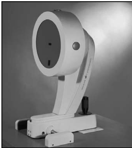
Pentacam Scheimpflug Technology for Lasik.

Topography and imaging for LASIK patient screenings were further advanced with the development of the Pentacam (Oculus, Inc., Lynnwood, Wash., USA). This technology provides 3-dimensional images of the cornea and entire anterior segment of the eye captured by a rotating Scheimpflug camera along with software analysis. 34-37