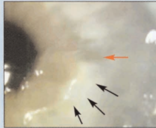
A dry spot (red arrow) and yellow/orange iron deposits in a patient with post-LASIK dry eye.

LASIK, especially if the hinge is superiorly located, can sever the corneal nerves, resulting in a temporary neurotrophic keratitis. Another important reason, I believe, for dry eye post-LASIK is the change in corneal curvature between the treated and non-treated zones caused by the ablation. This creates an abrupt change in